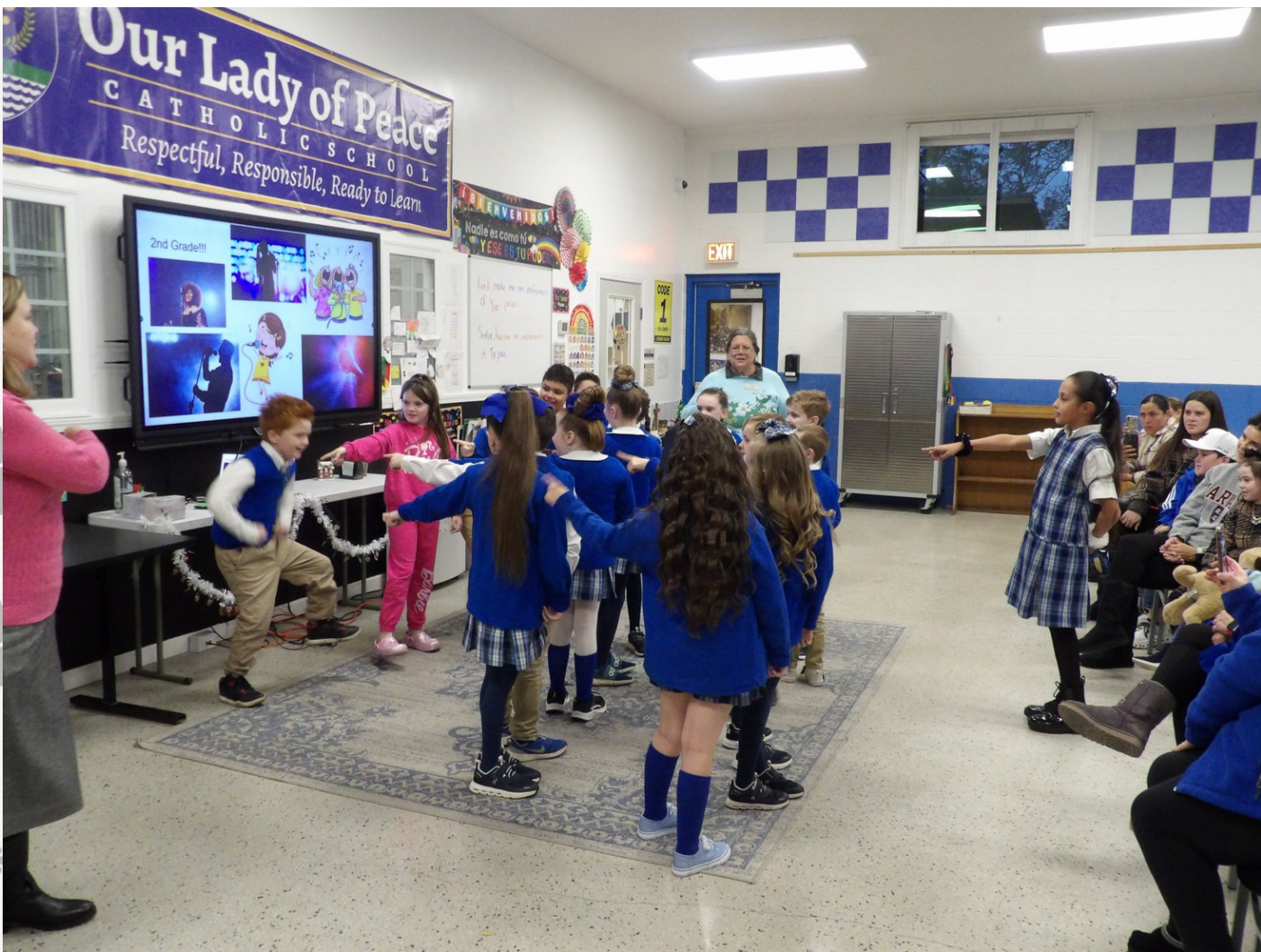
🙏 Cardinal Virtue Winners 🙏