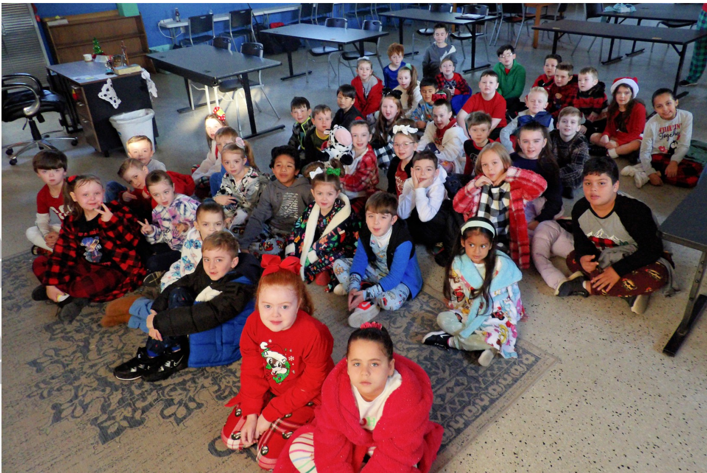
👶 1st and 2nd Grade