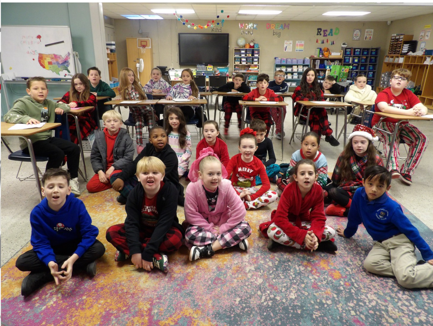
*3rd and 4th Grade