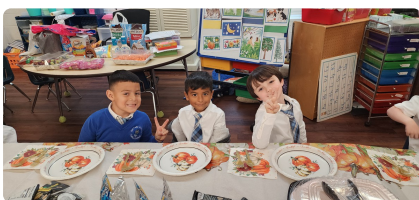
Kindergartners getting ready for a Thanksgiving feast!