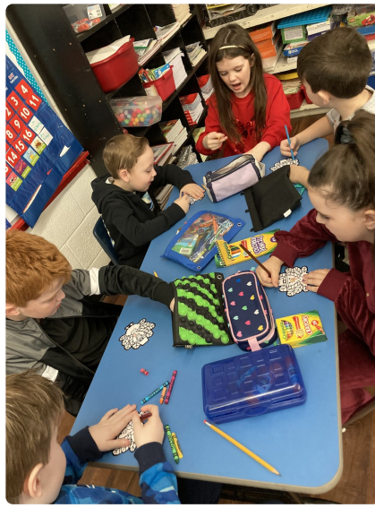
Literacy Day project with 2nd Grade.